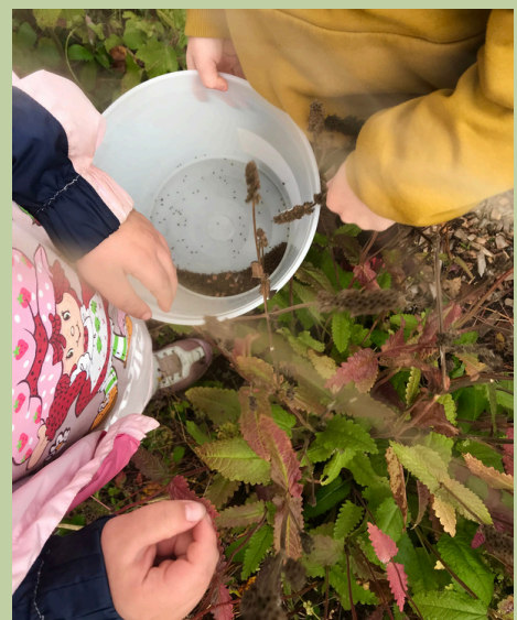
Saving seeds with Scotsburn Elementary students this fall.