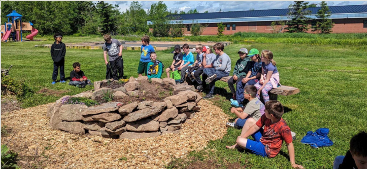
Ms. Grant's grade 4/5 class from Scotsburn Elementary

Our Food Forest was engaged as an outdoor classroom for important hands-on learning through the spring and fall this year. We led mini greenhouse climate action and Earth Day activities, as well as planted and saved seeds with the students at Scotsburn Elementary next door. We also hosted field trips from other schools.