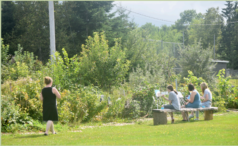
Painting event with local artist at the Food Forest